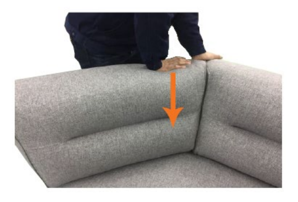
Step 4: Affix the Left side seat back to the seat base using the bolts and washers, just as in Step 2.